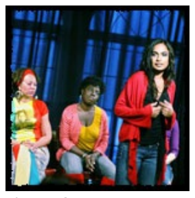
Photo of women poets from women words power, Directed by Cody Jones

Support us by shopping on Amazon Smile. Merchants donate 5% of eligible purchases to The Essential Theatre programming at no added cost to you. Click our unique link below to begin making affordable purchases and support a great cause <a href="http://smile.amazon.com/ch/52-1749748">http://smile.amazon.com/ch/52-1749748</a>