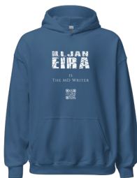
Sweatshirt – CUT SHORT