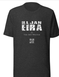
T-Shirt – CUT SHORT