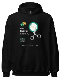
Sweatshirt – CUT SHORT $ 42