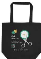
Tote Bag – CUT SHORT $ 23