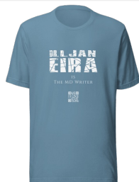
T-Shirt – CUT SHORT