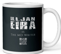
Mug – CUT SHORT