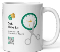
Mug – CUT SHORT $ 15.95