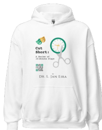
Sweatshirt – CUT SHORT $ 42