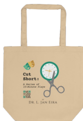
Tote Bag – CUT SHORT $ 23