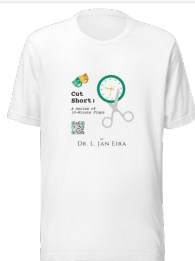
T-Shirt – CUT SHORT $ 25