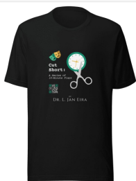
T-Shirt – CUT SHORT $ 25