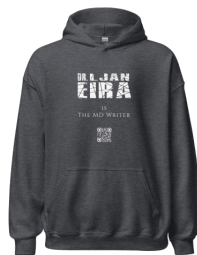
Sweatshirt – CUT SHORT